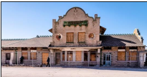
Train Depot, Rhyolite, Nevada

Gasses trapped in the lava that forms rhyolite often cause small, empty cavities (vugs). Later, when groundwater flows through the cavities, minerals can be deposited in the vugs. The vugs can become lined with crystals or opal. Some of the world's best deposits of red beryl, topaz, agate, jasper, and opal formed in rhyolite. Gem hunters are always on the lookout for vuggy rhyolite!