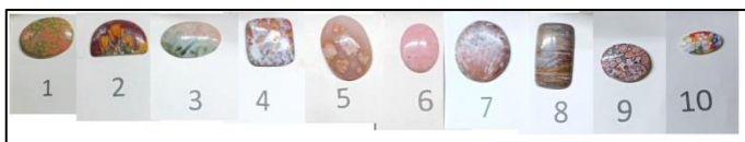
April 2024 Cabochon Contest Entries