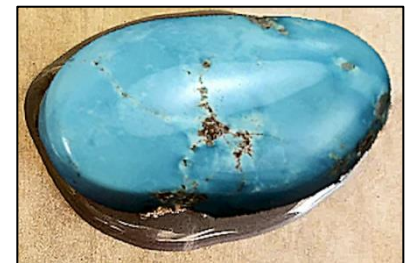
Cabochon Sitting on a Blob of Epoxy (Option A)