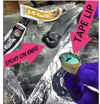
Cabochon Wrapped with Masking Tape (Option B)

OPTION B – IF YOU ARE WORKING WITH A CABOCHON - Wrap a strip of masking tape around the edge of the cabochon. The tape height above the BACK of the stone should be as deep as you want the backing. Don't worry about the height of the tape above the FRONT of the stone. Use the knife or popsicle stick to cover the BACK of the stone with the mixed epoxy, and smooth the epoxy even with the lip of the tape. Gently place on a sheet of foil.