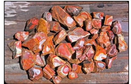
Rhyolite from Seho Mountain Fallon, Nevada

the St. Andrew Strait volcano in Papua New Guinea (1953-1957), the Novarupta volcano in Alaska (1912), and Chaitén in Chile (2008). Active volcanoes in Iceland, Yellowstone in the United States, and Tambora in Indonesia are capable of producing rhyolite. There is a lot of rhyolite in the Newberry Mountains in Clark County, Nevada.