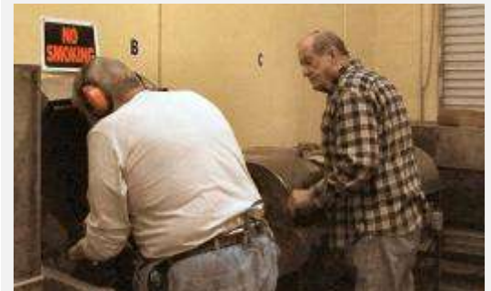
Right: the saws are very much in use