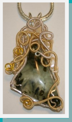
September Wire Wrapping Project

Wire wrapping, led by Sue Moore meets on most Mondays (except for the General Meeting night). Hours for the class are 5 - 8 PM. The wire wrapping classes for September are the 11th, 18th, & 25th. For more information call Sue Moore at 702-348-9600.