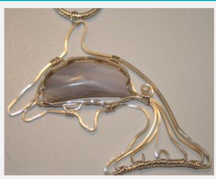
September Wire Wrapping Project

Wire wrapping, beading, polymer clay, and silver smithing have a very modest donation of $5.00 per session, that goes to the club. Faceting is $5.00 an hour, the cost of faceting machine use, or a flat $5.00 if you use your own machine. Other class donations may vary, depending on what is included in the class. All donations go to SNGMS, all instructors volunteer their time and expertise.